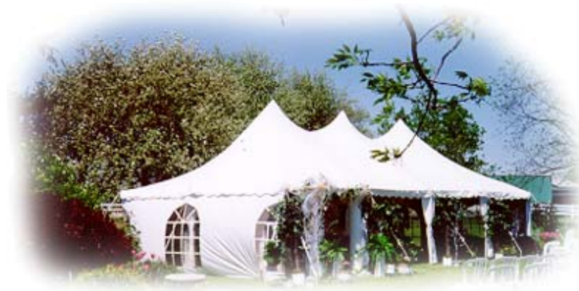
Pole tent 20 x 40' Windows No. 001