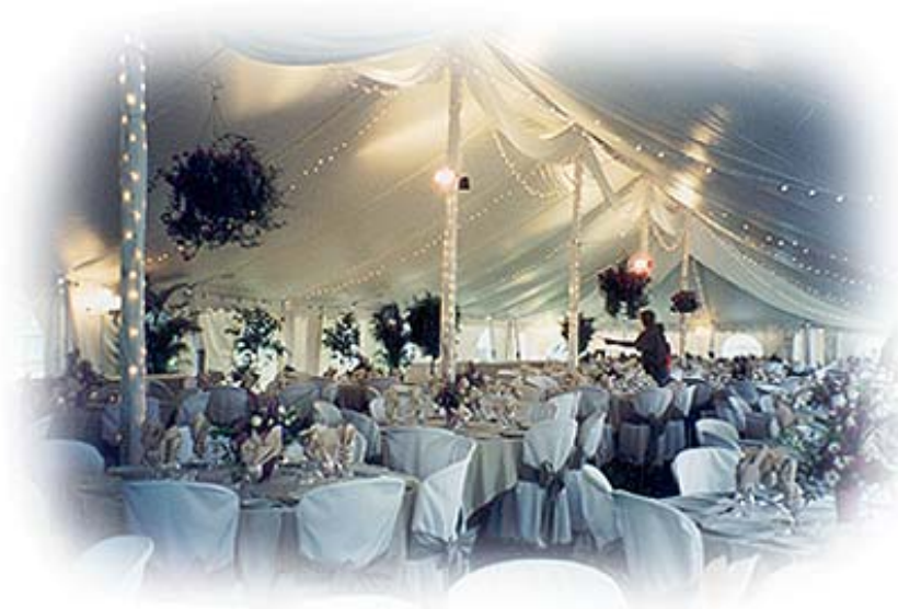
Pole tent 40 x 100' No. 009