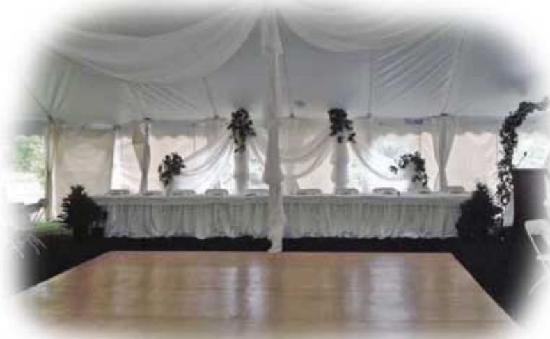
White pole tent 60' x 80' with 16' x 32' Dance Floor in front of Headtable