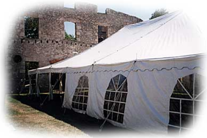
Pole tent 40' x 60' No. 004