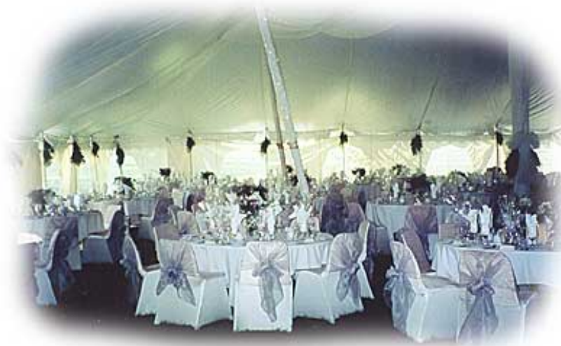
Inside of a 60' x 80' pole tent. No. 105