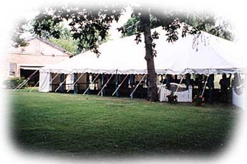
Pole tent 60' x 60' No. 005