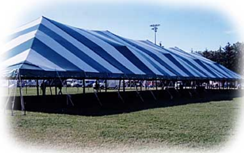
Green & White 60 x 180' No. 105