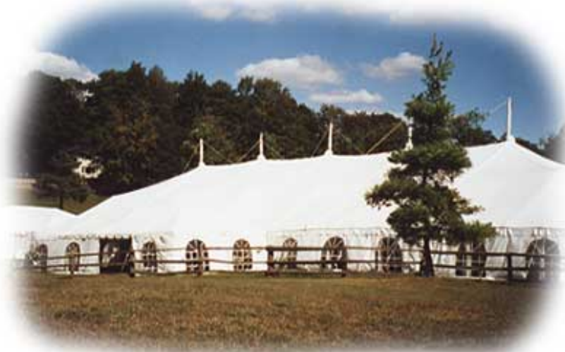
White pole tent 60' x 140' No. 002