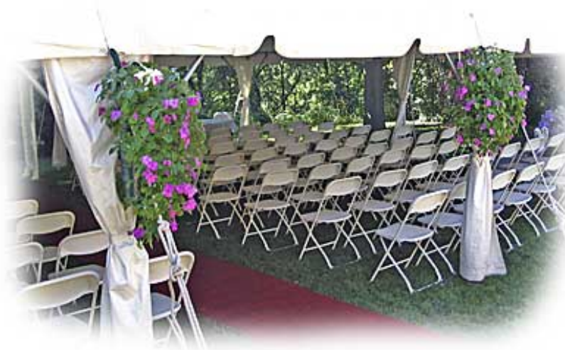
White Frame Tent for ceremony 30' x 40' No. 204