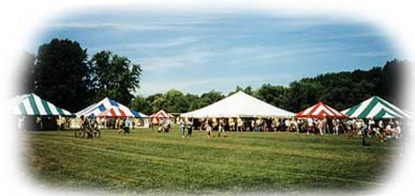
White tent 40' x 40' Green and white 40' x 40' Blue and white 40' x 40' Red and white (3) 15' x 15' Green and white 30' x 60' No. 012