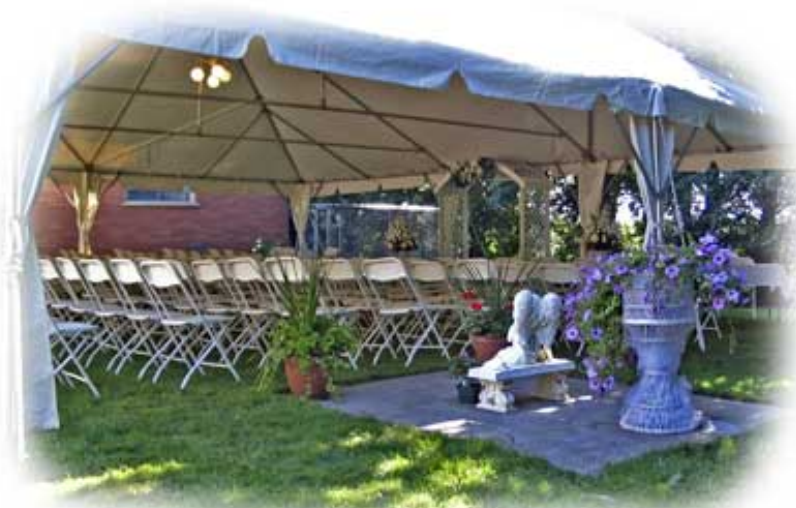
White Frame Tent for ceremony 30' x 40' No. 202