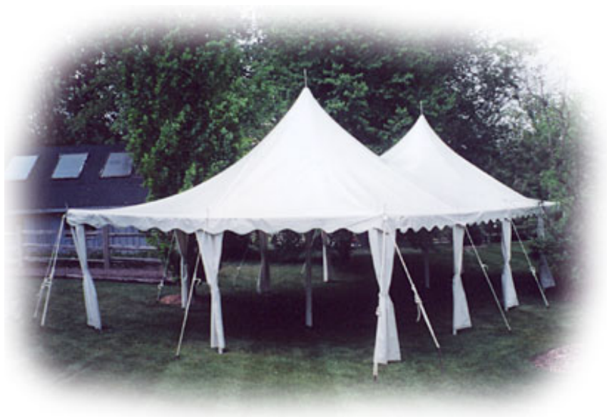
White Pole Tent 20' x 40'