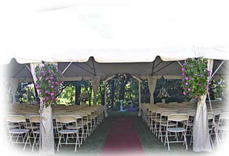
White Frame Tent for ceremony 30' x 40' No. 203