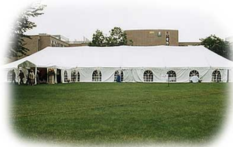
White pole tent 40' x 120' with Entrance canopy 7' x 10' No. 003