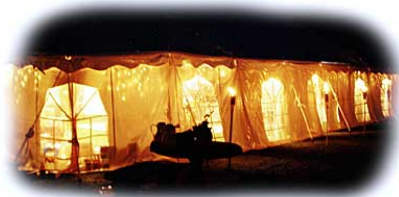
Night shot of white pole tent 30' x 60' No. 102