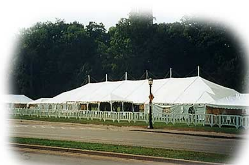
Main tent 60 x 160' 3 Peak pole tent 20' x 40' Frame tent (near back) 20' x 40' Entrance (near front) 14' x 12' No. 007