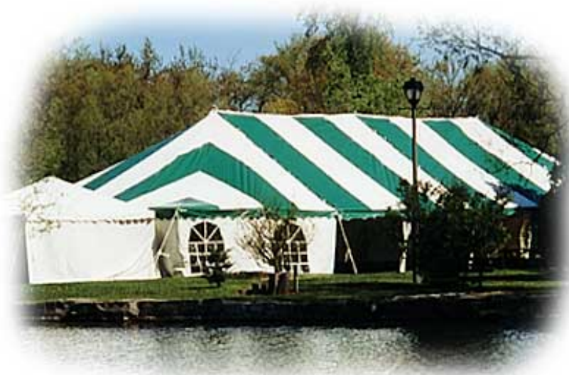
Green and white tent 40' x 80' Frame tent 14' x 14' No. 010