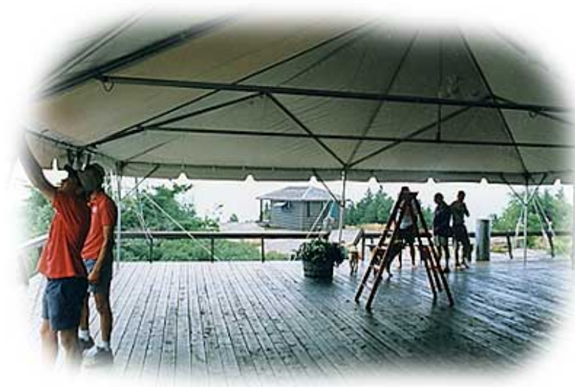
Inside of a frame tent 30' x 40' No. 015