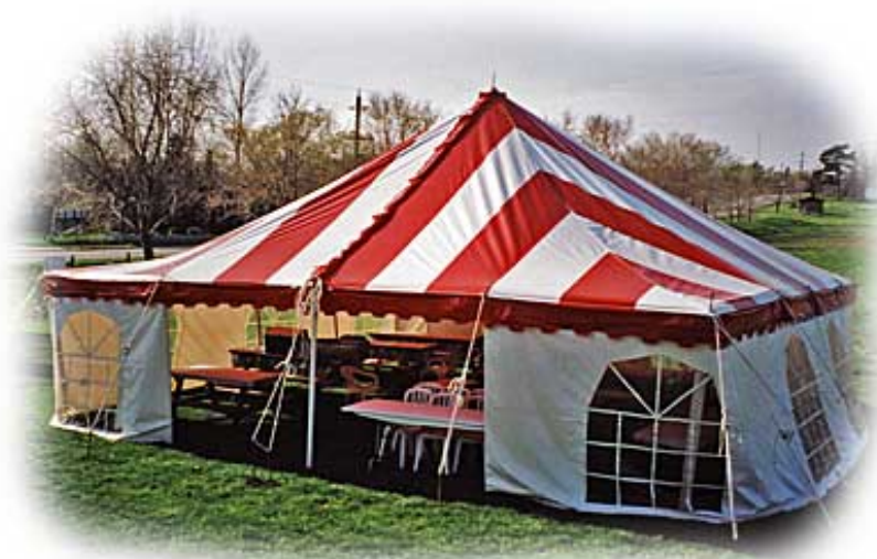
30' x 30' Red and White Pole Tent No. 217