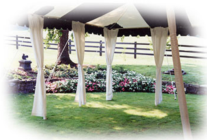
Side pole drapes No. 005