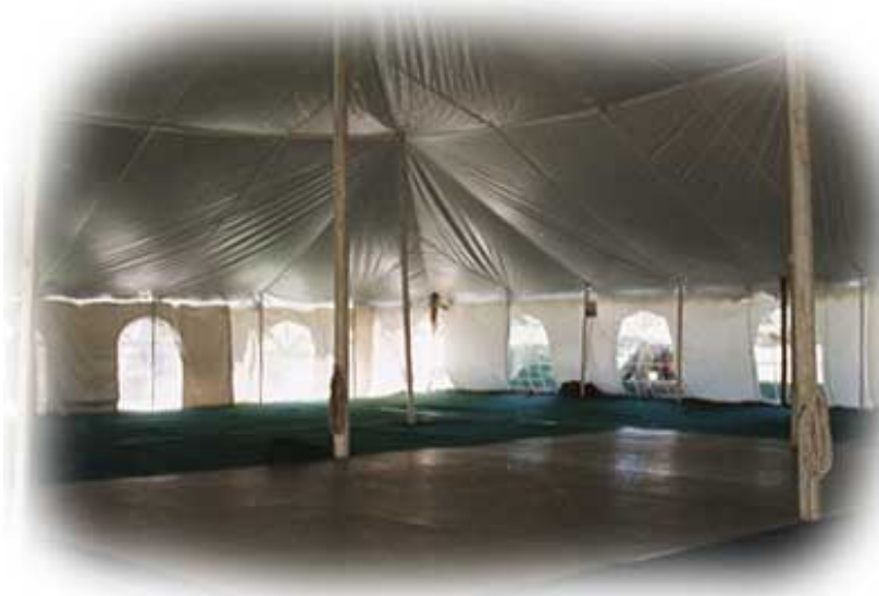
White pole tent 60' x 80' Dance floor 16' x 36' No. 013