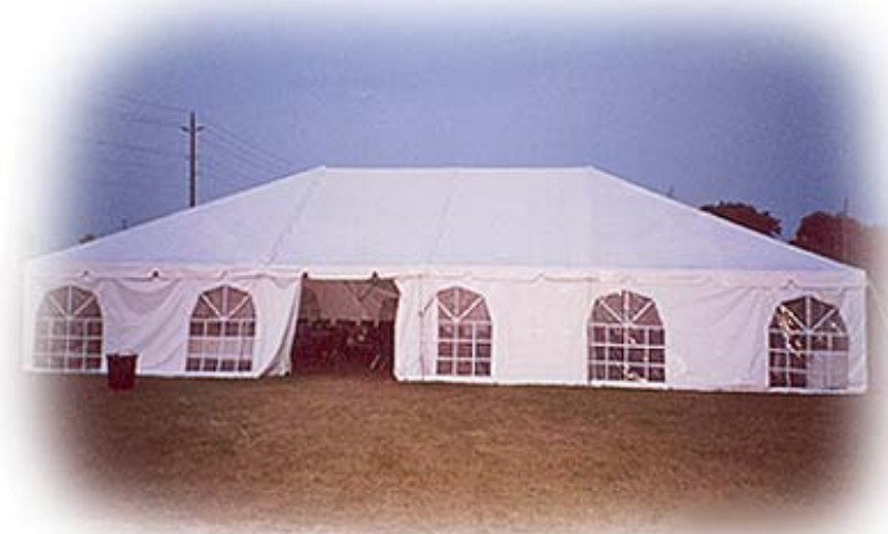
Frame tent 30 x 50' No. 005