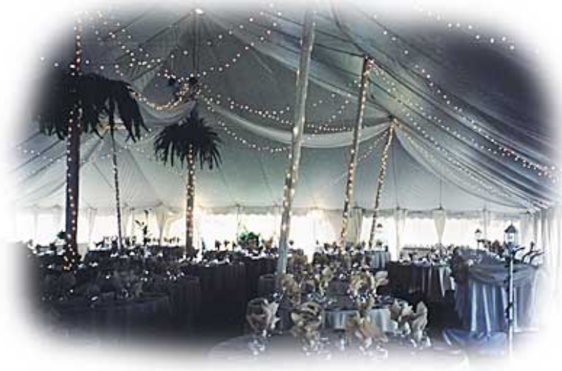
Inside of a white pole tent 60' x 100' No. 003