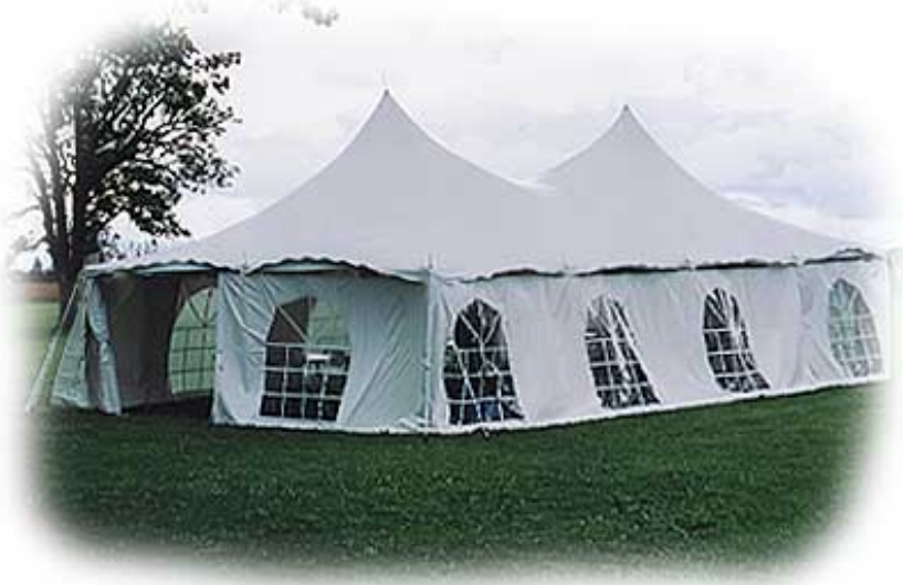
2 Peak pole tent 20' x 40' No. 007