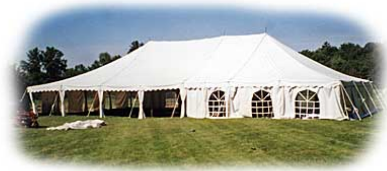
40' x 70' Pole Tent No. 218