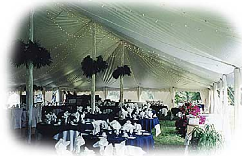
Interior shot of a 40' white pole tent No. 011