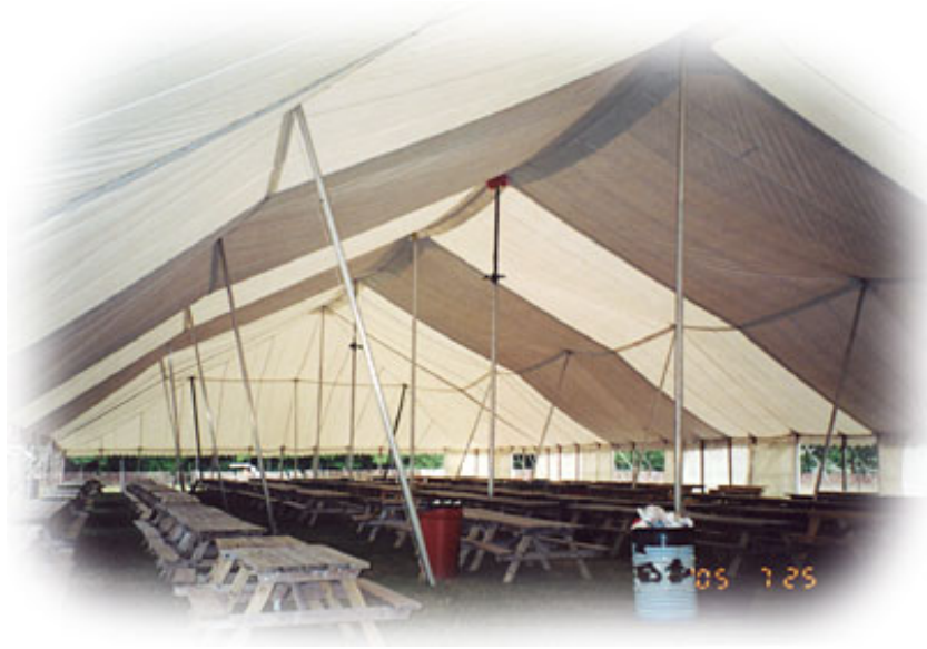
Inside of a 80' x 200' pole tent