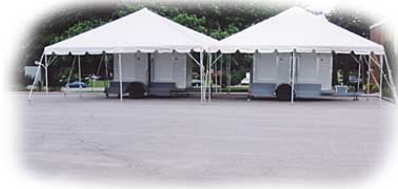
2 Frame tents 20' x 20' No. 010