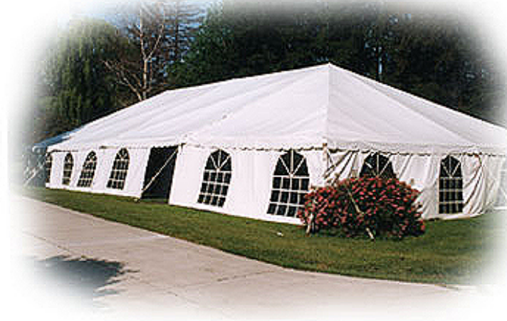
Frame tent Cathedral style window walls No. 002