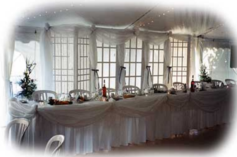
Inside of a 60' tent. (Head table on dance floor) No. 007