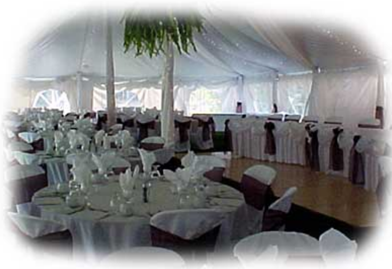
Head table on dance floor No. 006