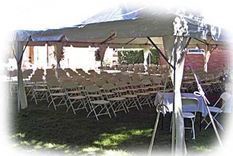
White Frame Tent for ceremony 30' x 40' No. 208