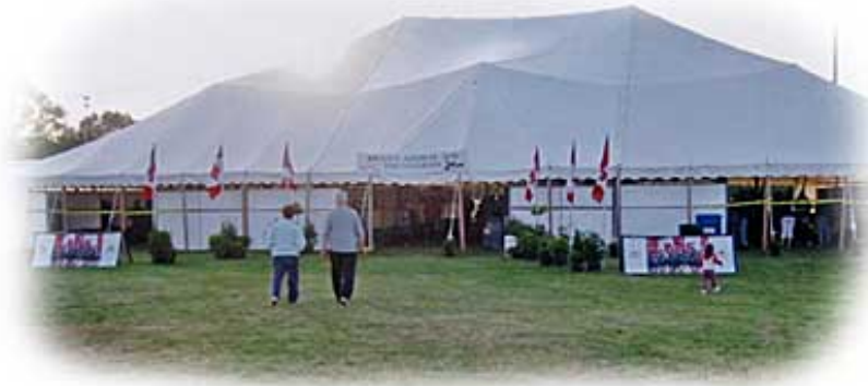
80' x 110' Tent No. 202