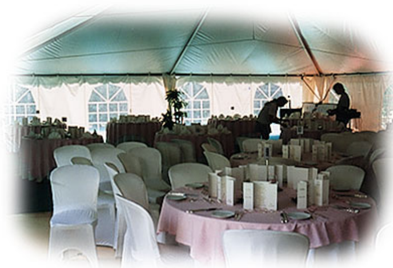
Inside of tent