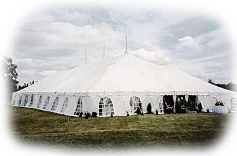
White pole tent 60' x 100' Windows No. 001