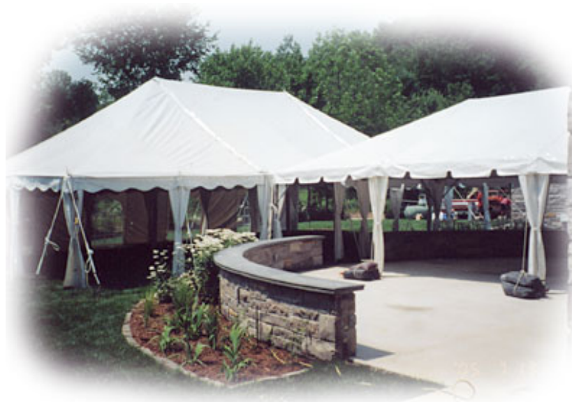
White Frame Tent 30' x 45' Pole 20' x 30' Frame