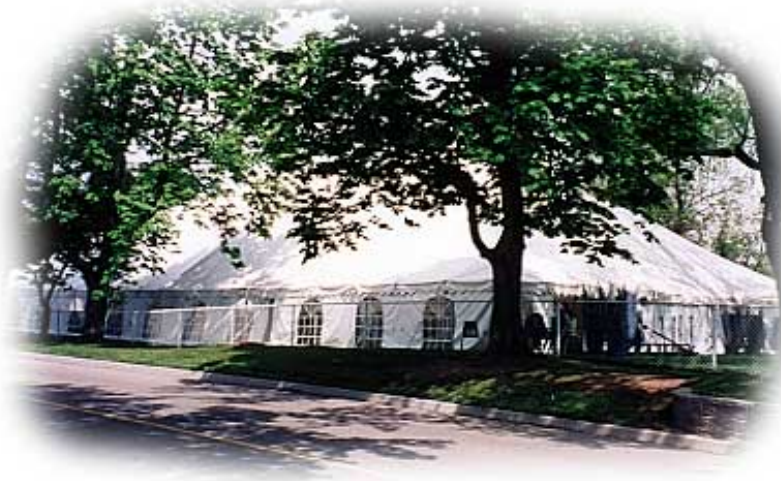
Pole tent 80' x 130' No. 008