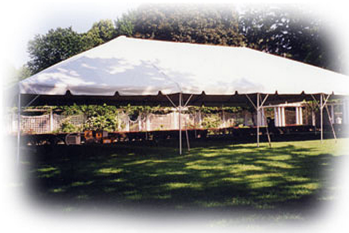
Frame tent 20x40' No. 006