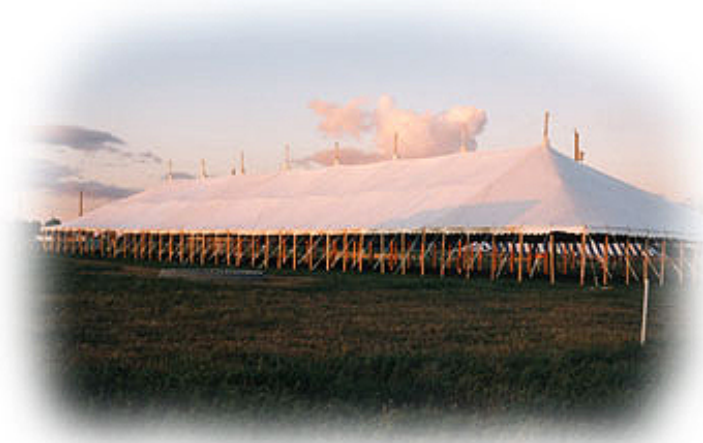
Pole tent Suitable for large outdoor events No. 003