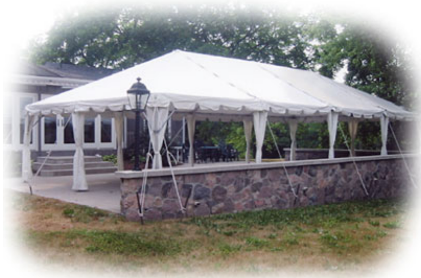
White Frame Tent 20' x 30'