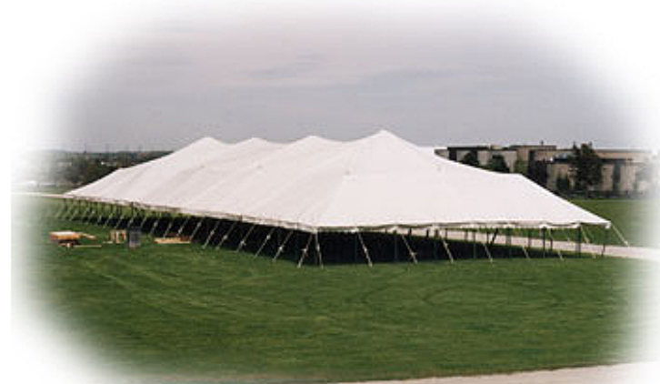
Pole tent Suitable for large outdoor events Up to 50, 60 or 80' wide No. 006