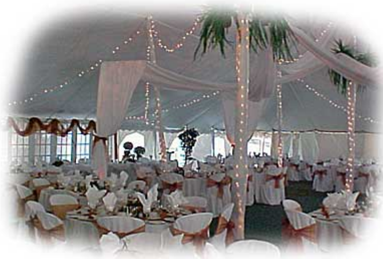
60' x 80' Reception Tent (interior) No. 211