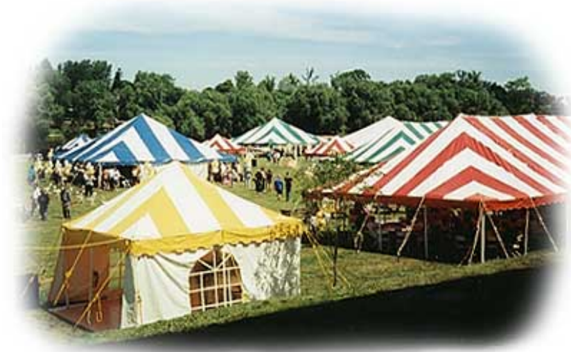
A variety of striped tents No. 013