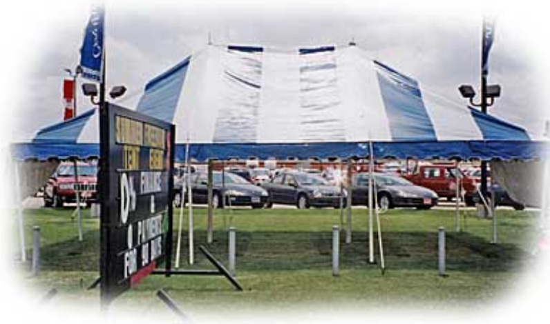
Tent No. 208