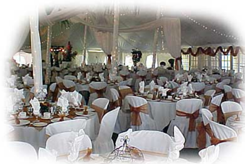
60' x 80' Reception Tent (interior) No. 213