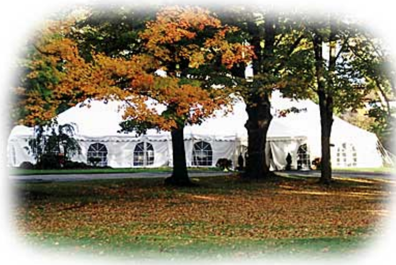
60' x 80' pole tent with 14' x 20' entrance tent No. 222