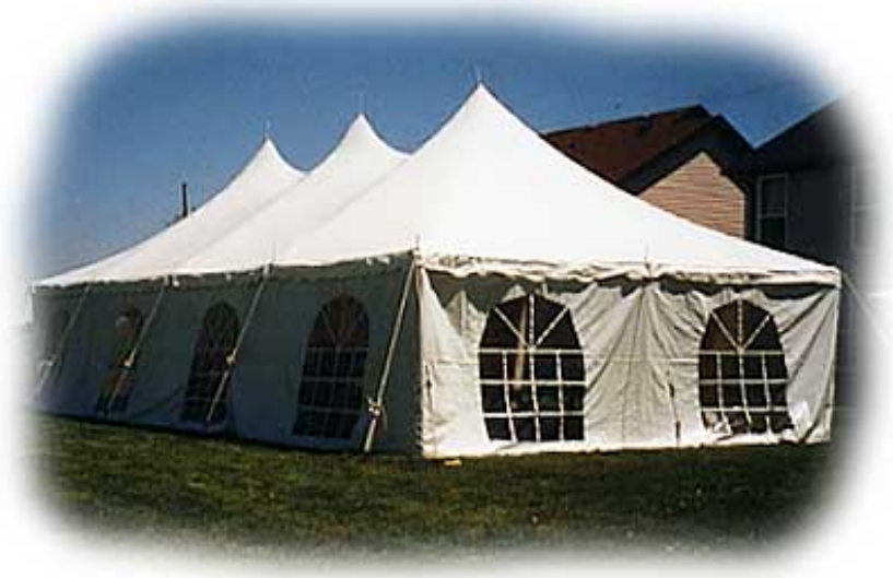
3 Peak pole tent 20' x 40' No. 006