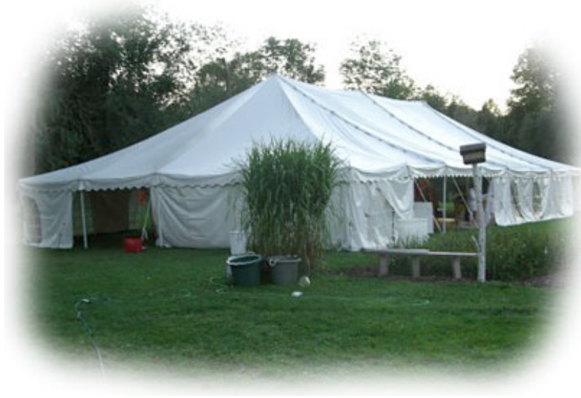
White pole tent 40' x 80'