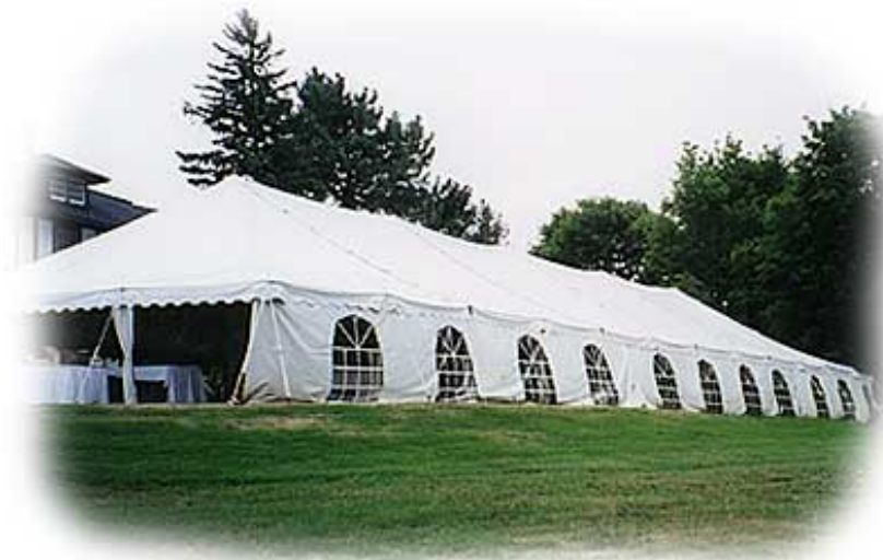
White pole tent 40' x 120' No. 012