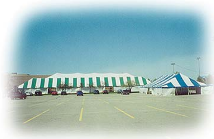
Blue and white striped tent 40 x 100'/ Green and white striped tent 40 x 180'/ White tent 80 x 180' No. 004