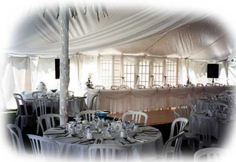
Inside of a 40' tent. (Head table on dance floor) No. 008