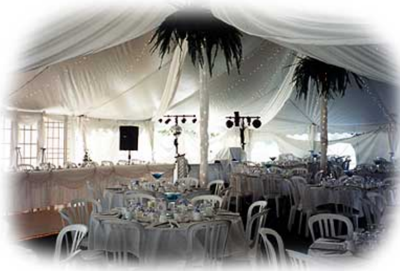
Inside of a 40' tent No. 002