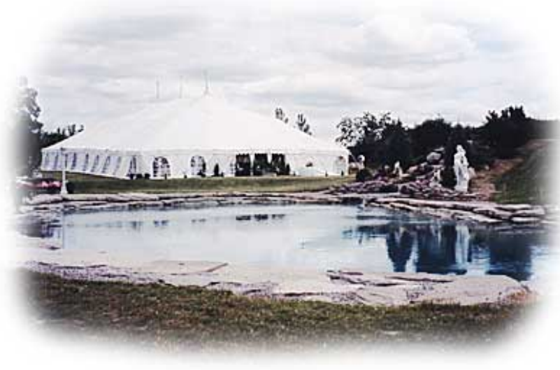
White pole tent 60' x 100' No. 002