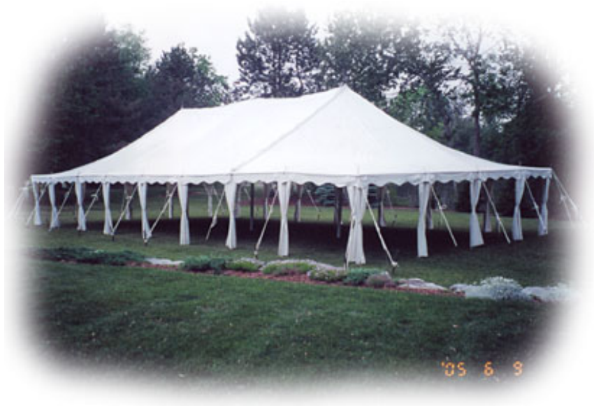
White Pole Tent 30' x 60'