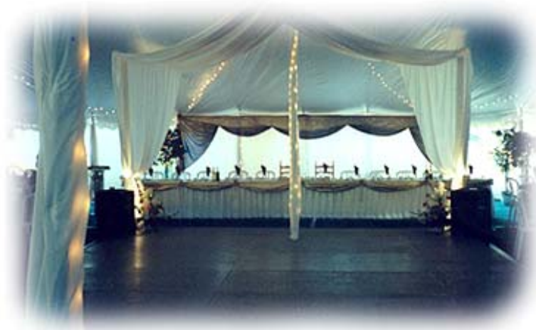
Dance floor Decorated for a wedding No. 010