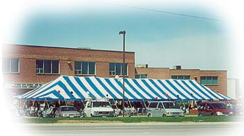
Pole tent Striped 30 x 100' No. 002