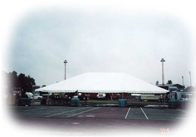
Frame Tent with Weights 40' x 60'