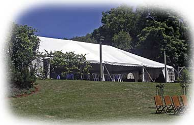
40' x 80' Frame Tent on tennis court surface No. 209