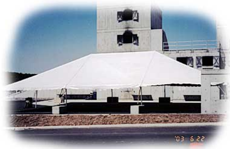
White frame tent 40 x 60' With Weights No. 101