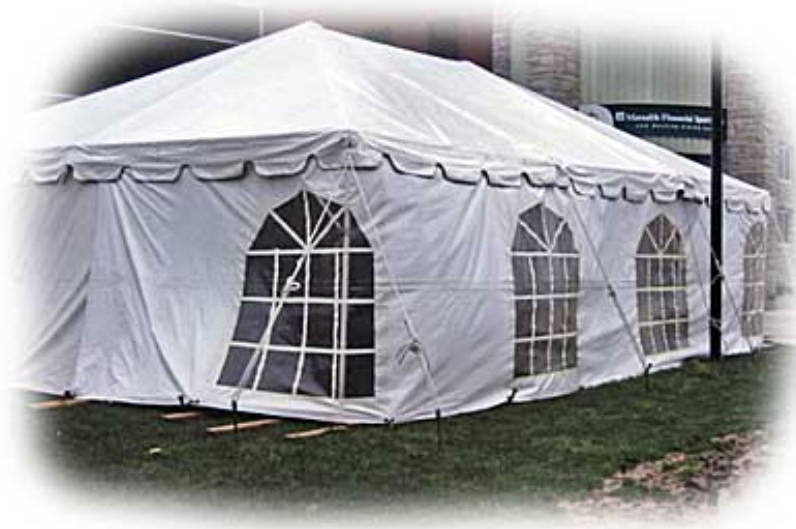
20' x 30' Frame Tent No. 200