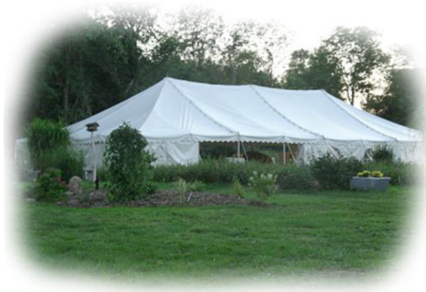
Pole Tent 40' x 80'