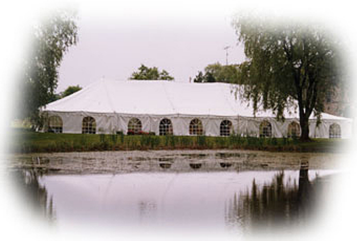
Pole tent 40x100' No. 007