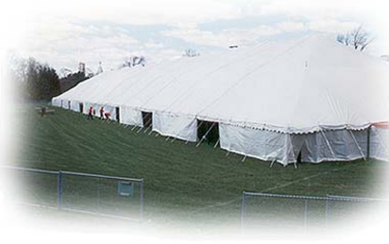
Pole tent 80 x 300' No. 001