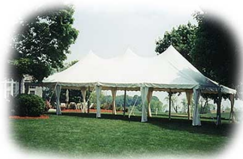
3 Peak pole tent 20' x 40' No. 005