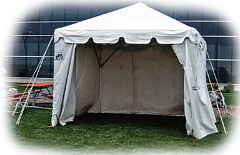
10' x 10' Frame Tent No. 204