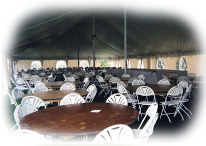
Tent 40' x 100' showing table layout