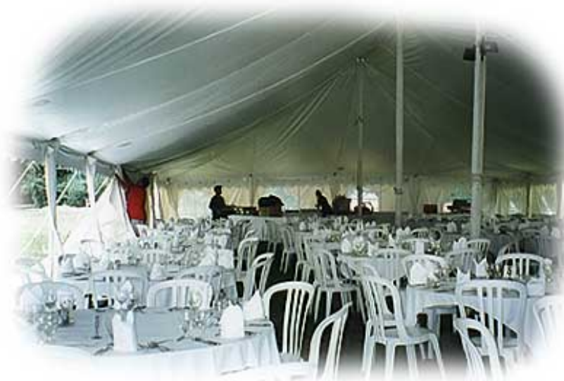
Interior shot of a white pole tent 40' x 120' No. 011