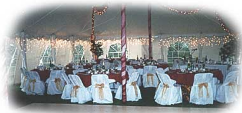
Interior shot of a white pole tent 30' x 60' No. 103