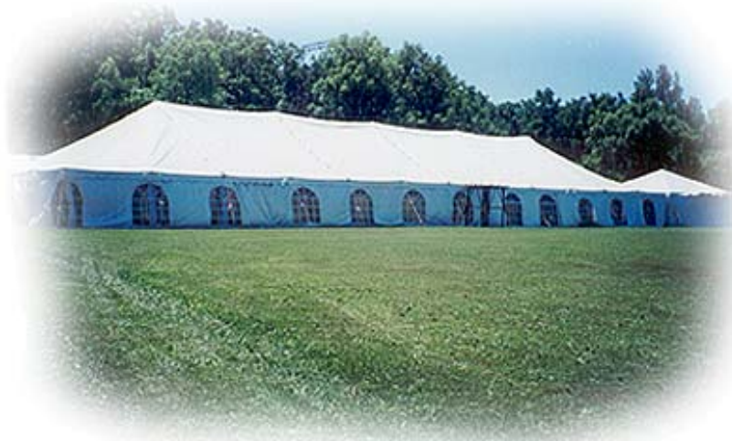
Pole tent 40 x 120' with Frame tent 20 x 20' No. 003