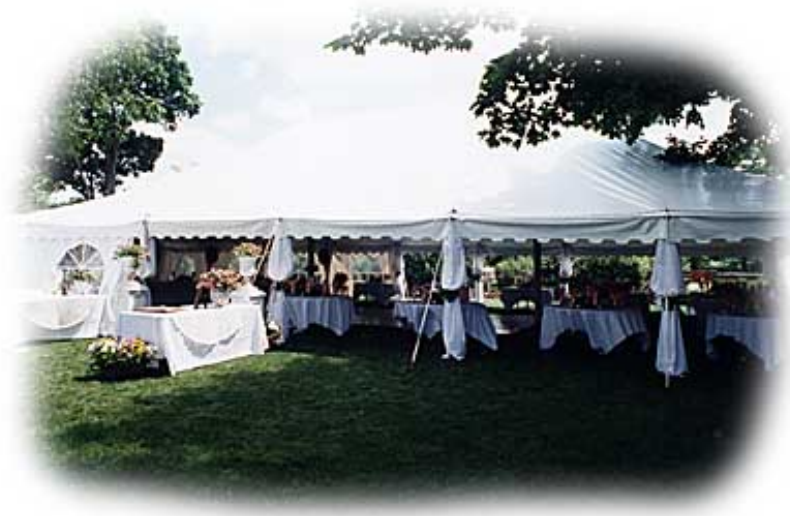
Pole tent 40' x 60' No. 007