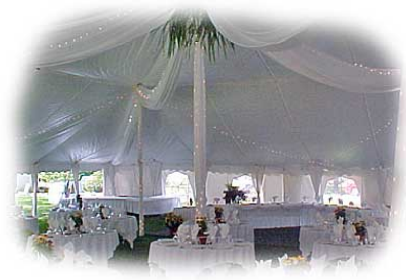
Interior of 60' x 60' pole tent No. 223