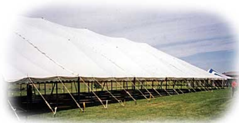
80' x 180' Tent No. 205