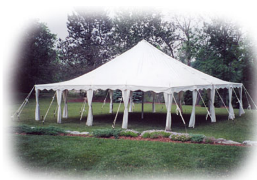
White Pole Tent 30' x 30'

See a pole tent being raised! View the movie .