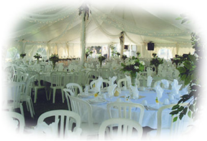
White Pole Tent 40' x 80'