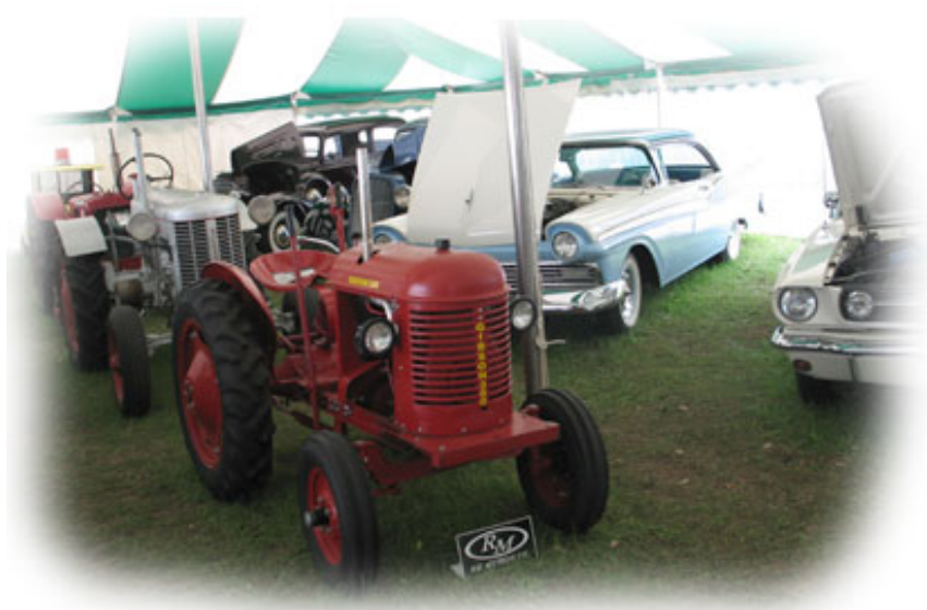
Pole Tent 40' x 140'