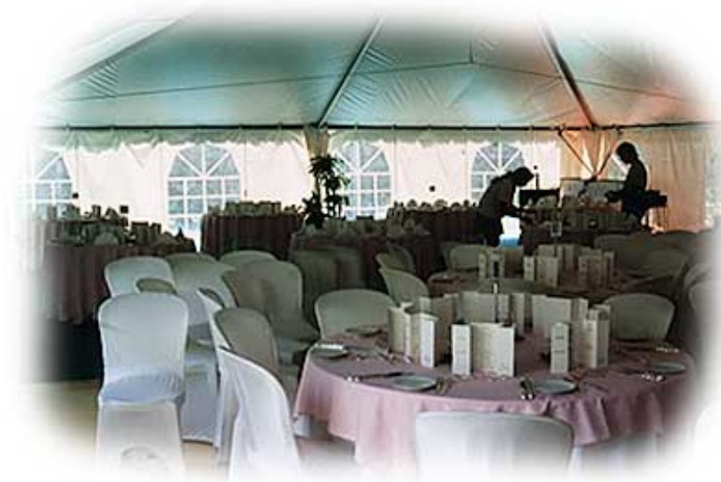
Inside of a frame tent 40' x 80' No. 014