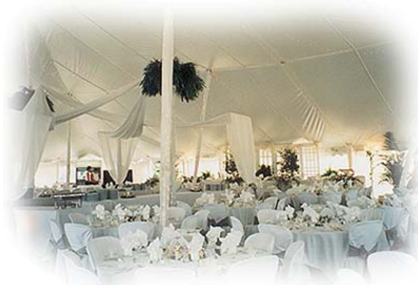
Pole tent 60 x 100' No. 007