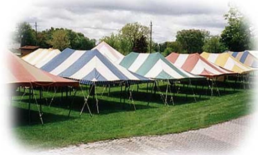
Tents 20' x 30' No. 011