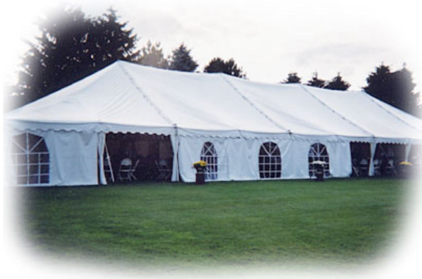
White Pole Tent 40' x 100'