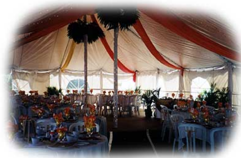
Inside of a 30' tent Round head tables on dance floor No. 010