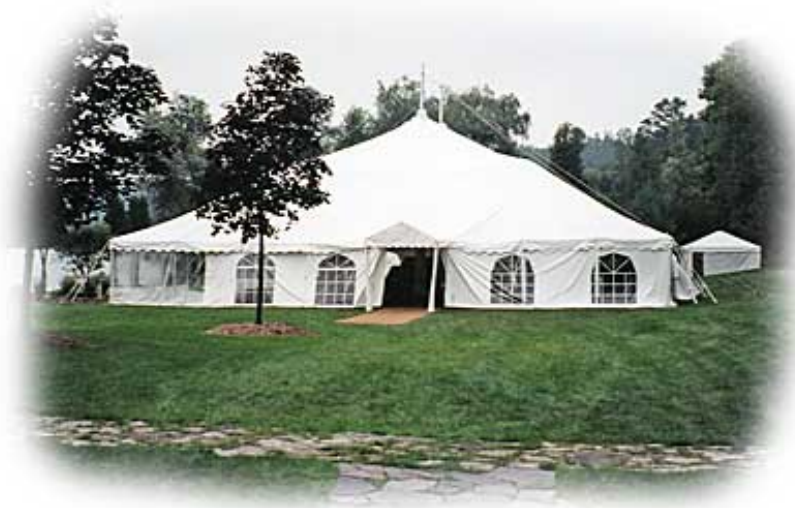
60' x 80' Pole Tent No. 215