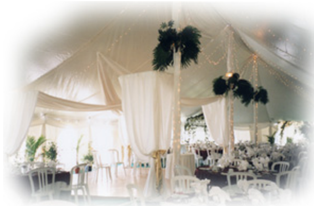
Above: Frame tent Left: Pole tent