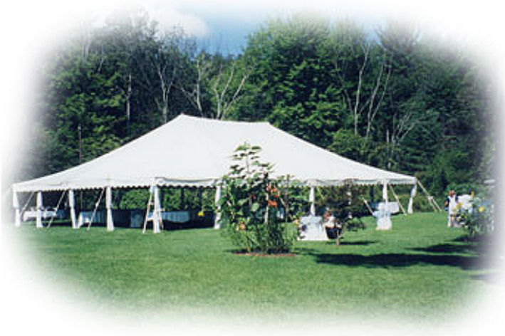
Pole tent 40x60' No. 010