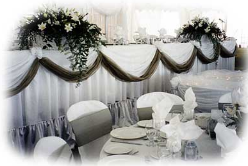
Head table No. 004