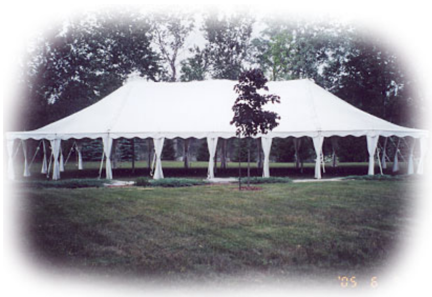
White Pole Tent 30' x 60'