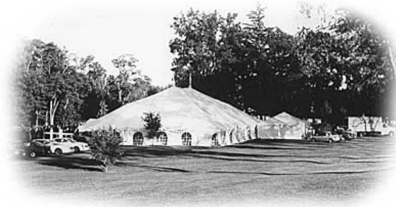
Outside of a 60' x 80' pole tent with 20' x 20' caterer tent beside. No. 104