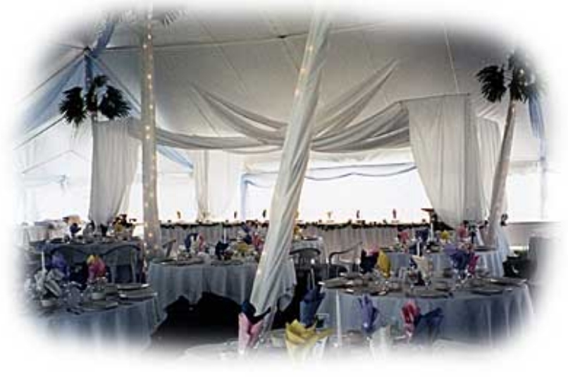
Inside pole tent 60' x 80' No. 006