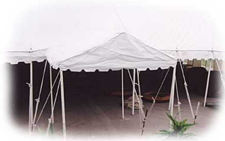
Entrance canopy 7 x 10' No. 009