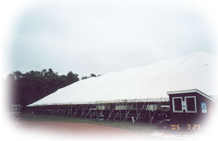
Pole Tent 80' x 200'