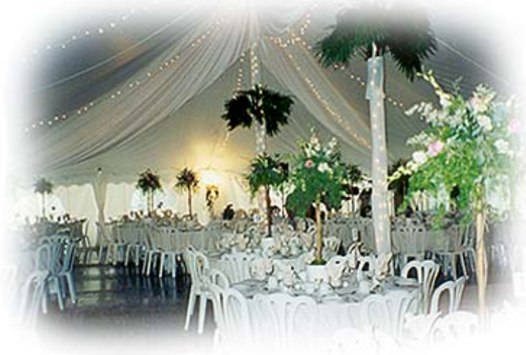
Pole tent 40' No. 002