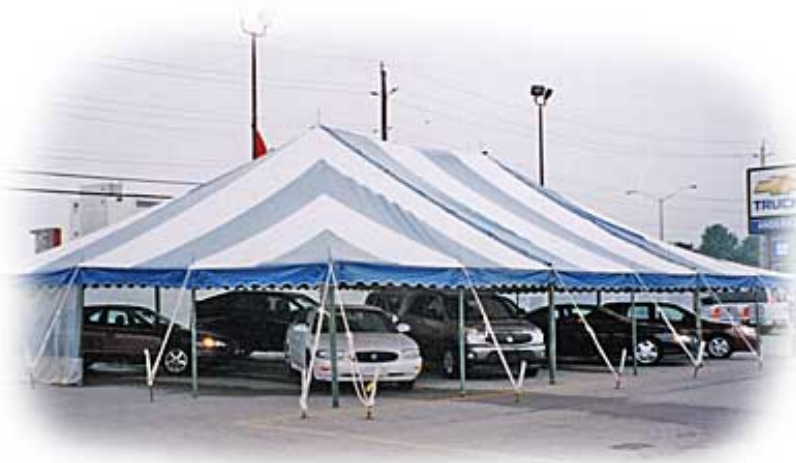
40' x 60' No. 209