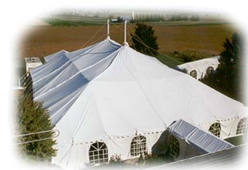
Pole tent 60 x 80' Aerial view No. 008