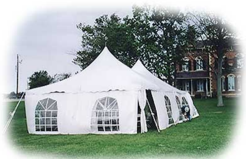
2 Peak pole tent No. 008