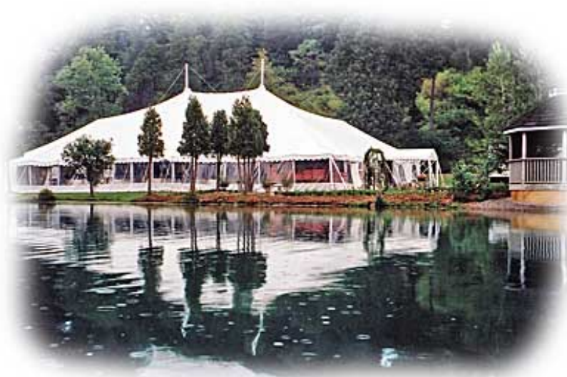
60' x 80' Pole Tent with 7' x 10' Entrance Canopy No. 216