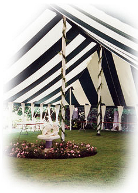
Pole tent incorporating existing landscaping in decorations Striped 40x80' No. 008