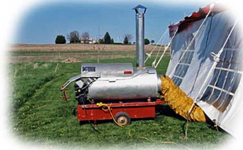
Heater 350,000 BTU's No. 203