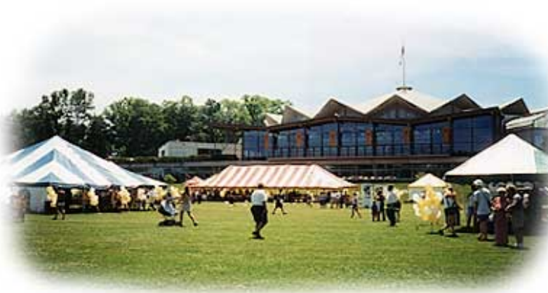
Green and white 40' x 40' Red and white 15' x 15' Yellow and white 15' x 15' Green and white 15' x 15' No. 010