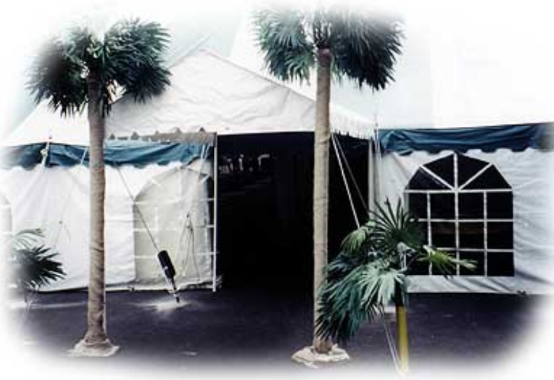
Pole tent 60' x 200' No. 009