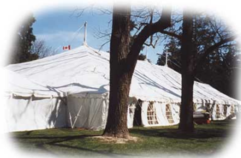
Frame kitchen tent 30' x 40' Tent 60' x 120' No. 004