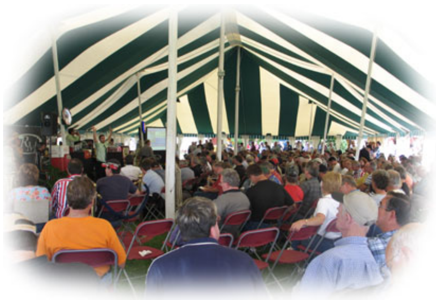
Pole Tent 50' x 100'