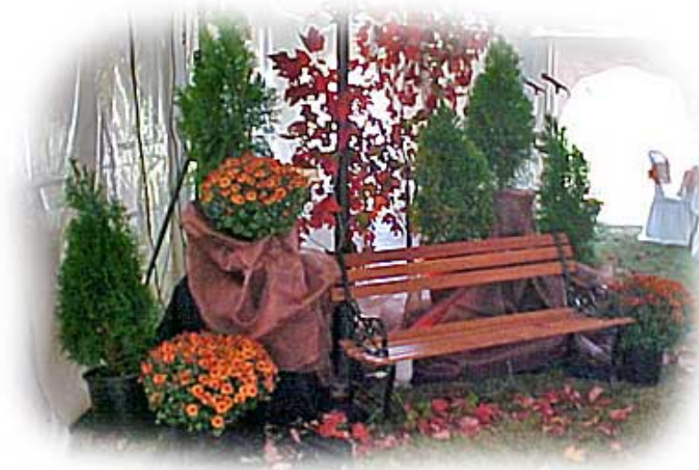
Bench 60' x 80' Reception Tent No. 202