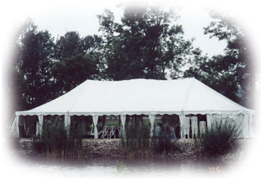
White Pole Tent 30' x 60'