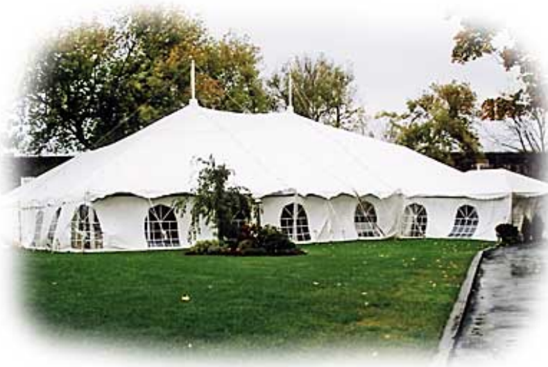
60' x 80' pole tent No. 221