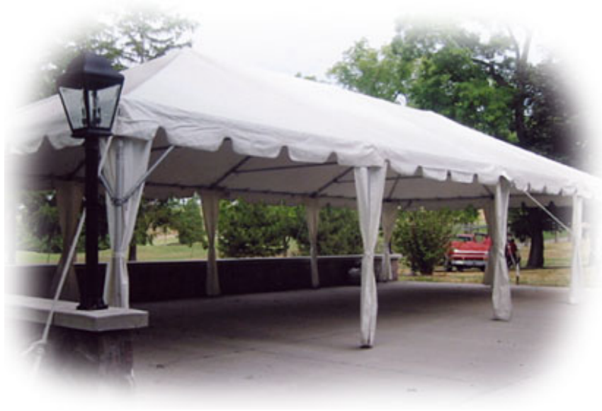
White Frame Tent 20' x 30'