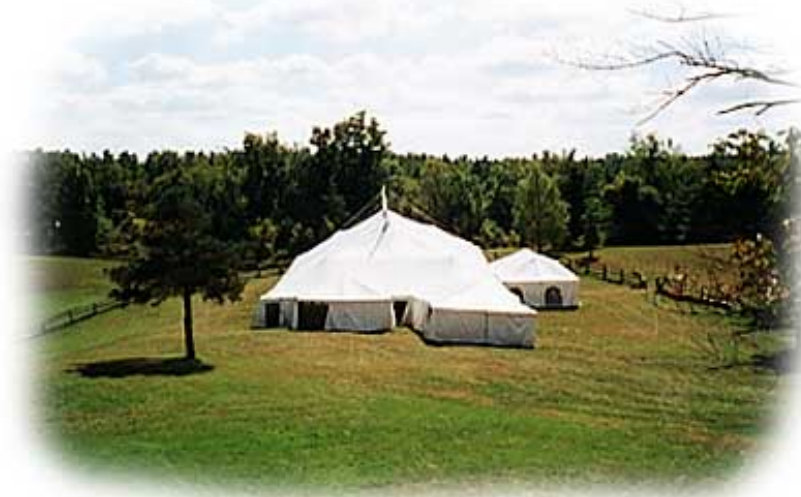
Main tent 60' x 140' Frame tent 20' x 20' Tent with window walls 20' x 40' No. 009