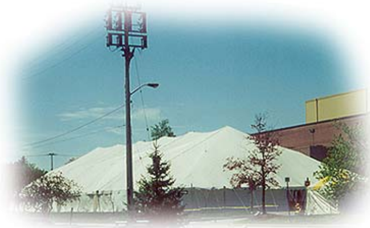
Pole tent 80 x 230' No. 005