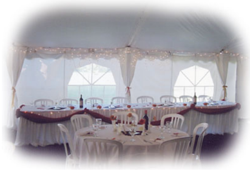
Headtable of Tent with window walls 40' x 60'