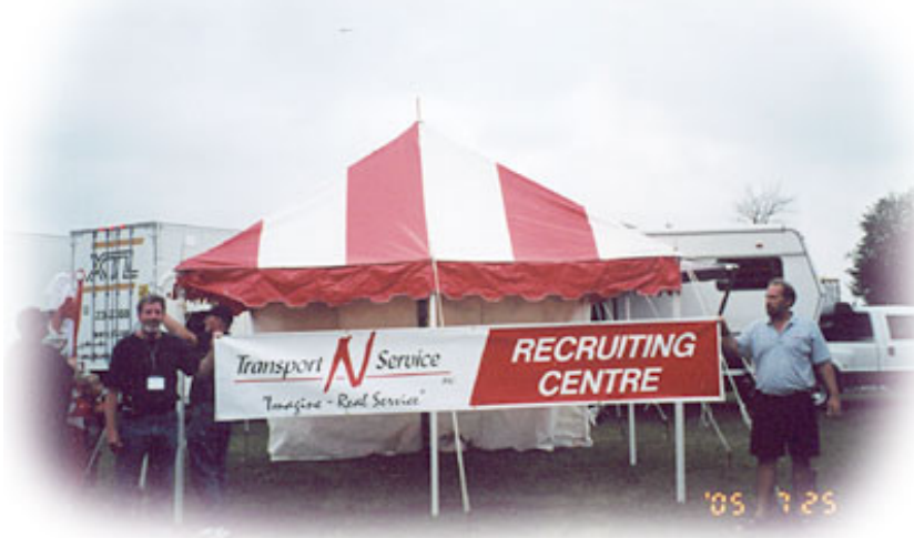
Red and white pole tent 15' x 15'