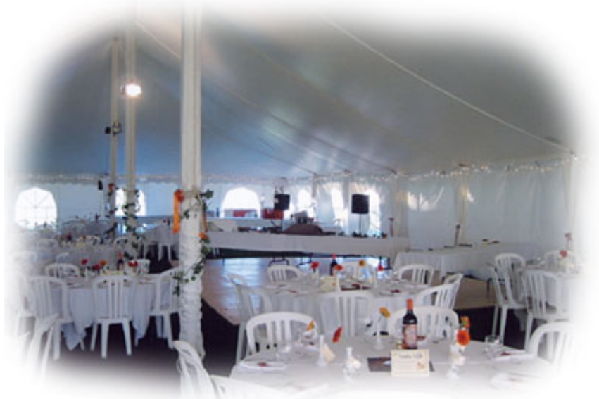
Pole Tent 40' x 80' 16' x 24' Floor