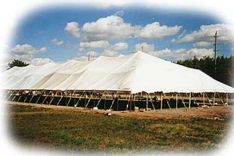
Pole tent 60' x 200' No. 009