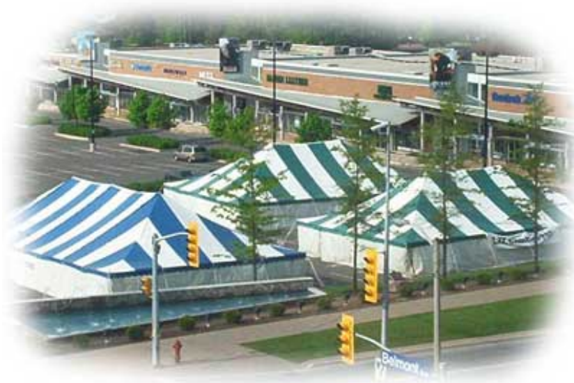
Blue and white 40' x 80' Green and white 40' x 60' (2) No. 014