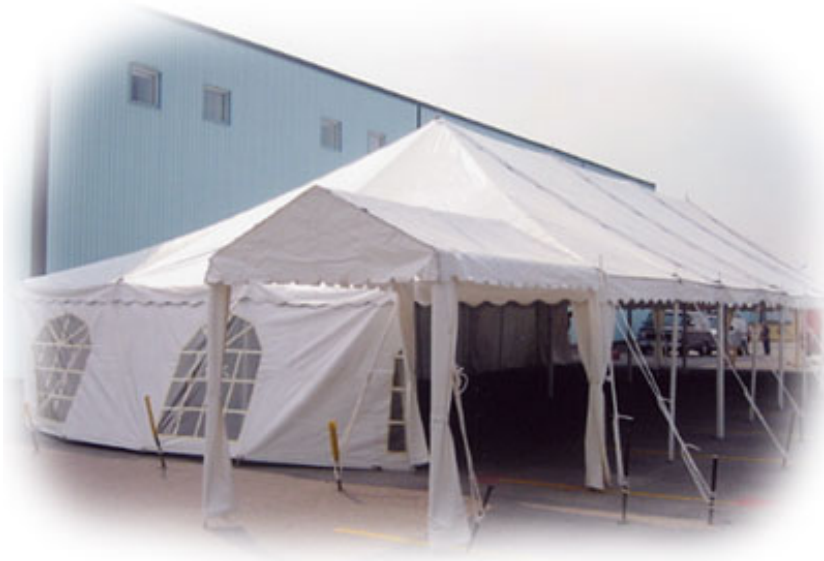
White Pole Tent 30' x 75' with 7'x 10' Entrance Canopy