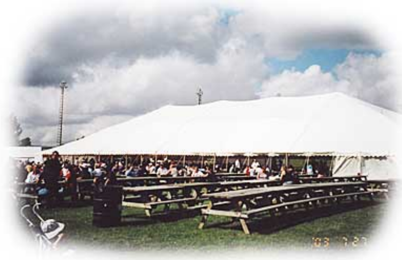
Pole tent 80 x 160' No. 103