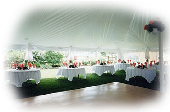
Pole tent Interior fully decorated Dance floor No. 003