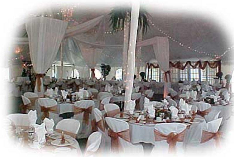
60' x 80' Reception Tent (interior) No. 212