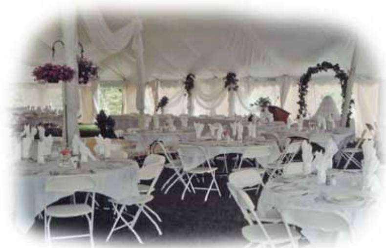
White pole tent 60' x 80'