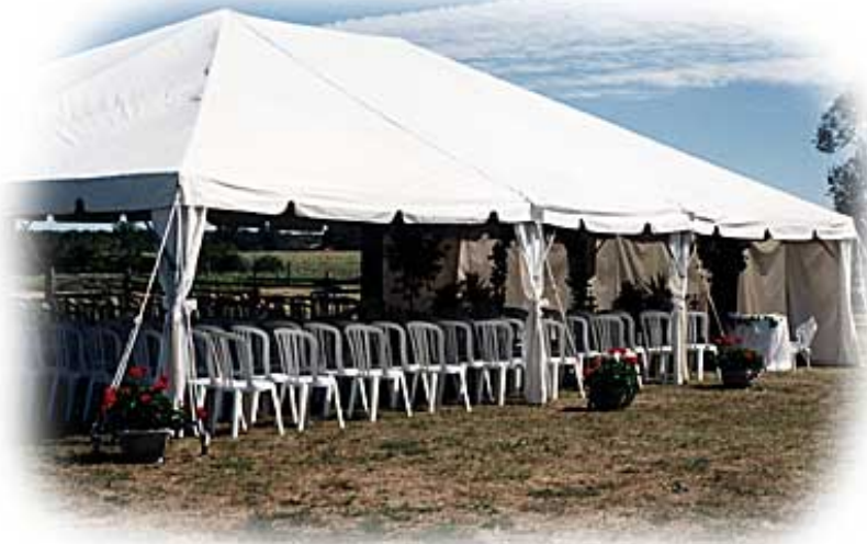
Frame tent 30 x 40' No. 008