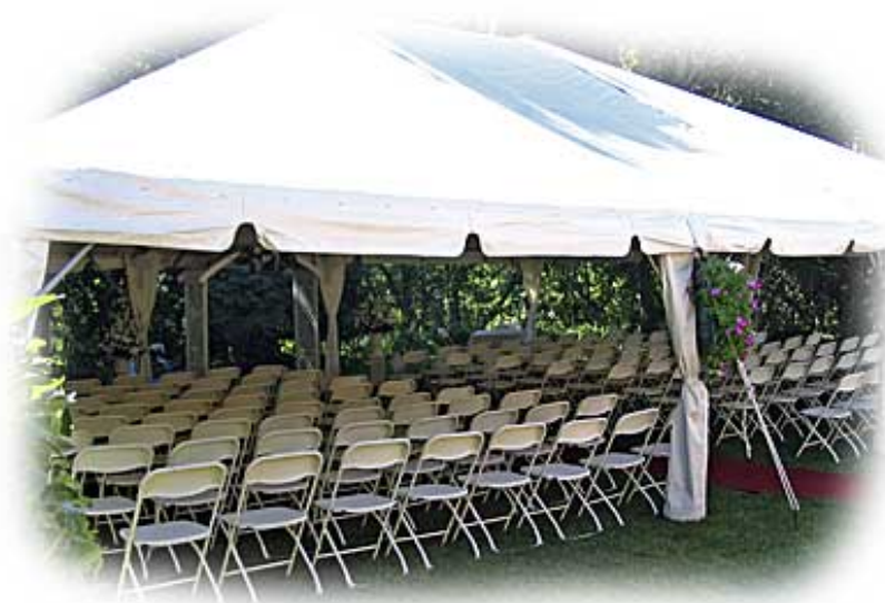
White Frame Tent for ceremony 30' x 40' No. 205