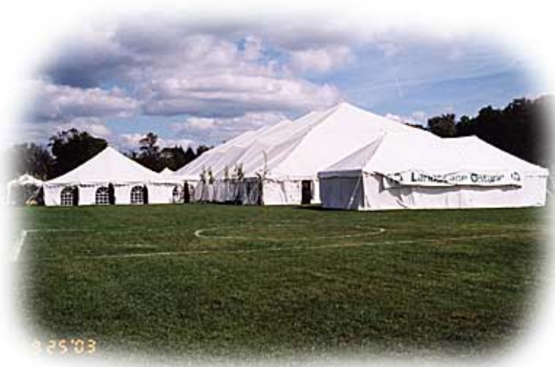
Pole tent 80 x 180' 40 x 80' 40 x 60' No. 104