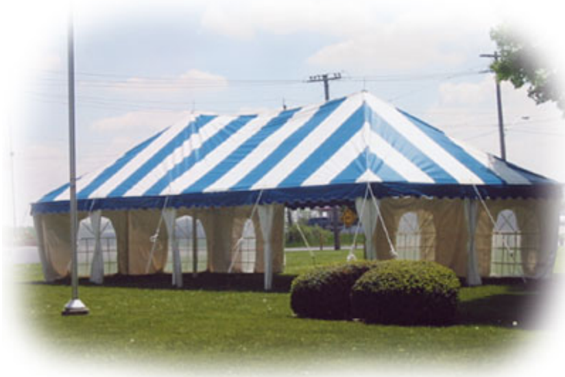
Blue and white pole tent 20' x 40'