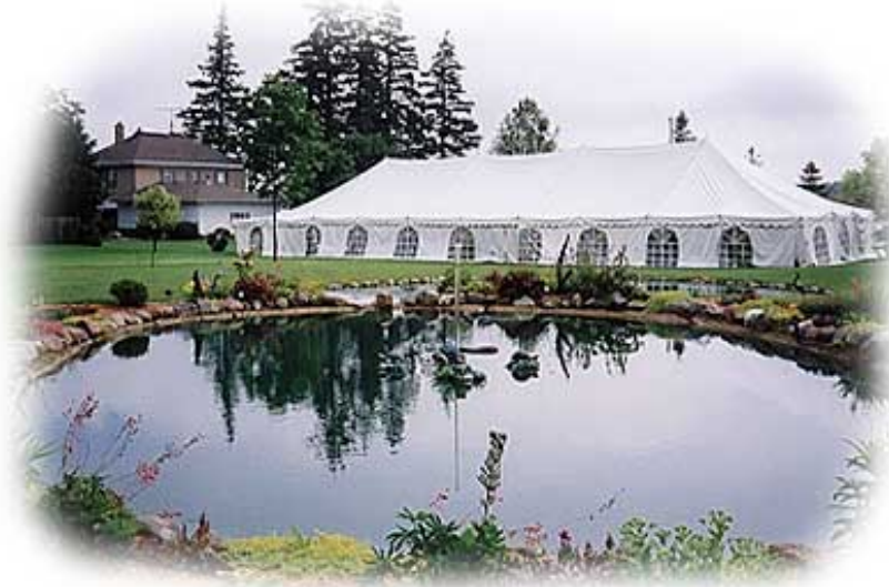
White pole tent 40' x 100' Windows No. 001