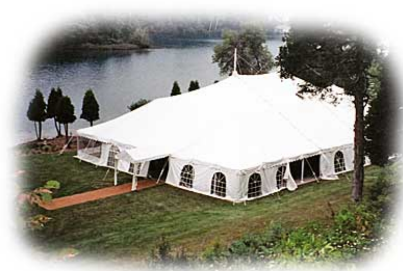
60' x 80' Pole Tent with 7' x 10' Entrance Canopy No. 214