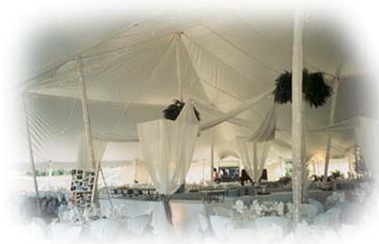
Pole tent 60 x 80' No. 011