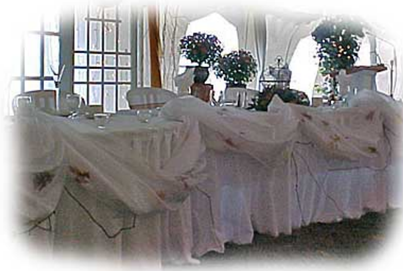
Headtable of 60' x 80' Reception Tent No. 201

Click to view our other portfolios! Download our Wedding Flyer (PDF).