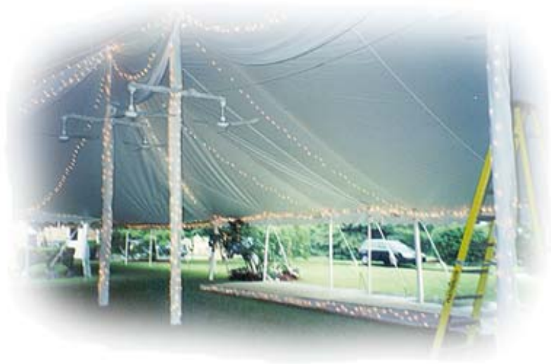
Pole tent 40' No. 012