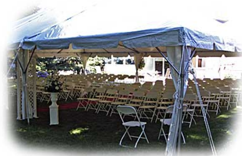
White Frame Tent for ceremony 30' x 40' No. 207