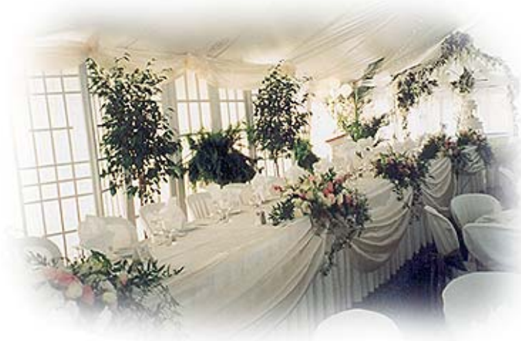
Decorations for a wedding No. 004