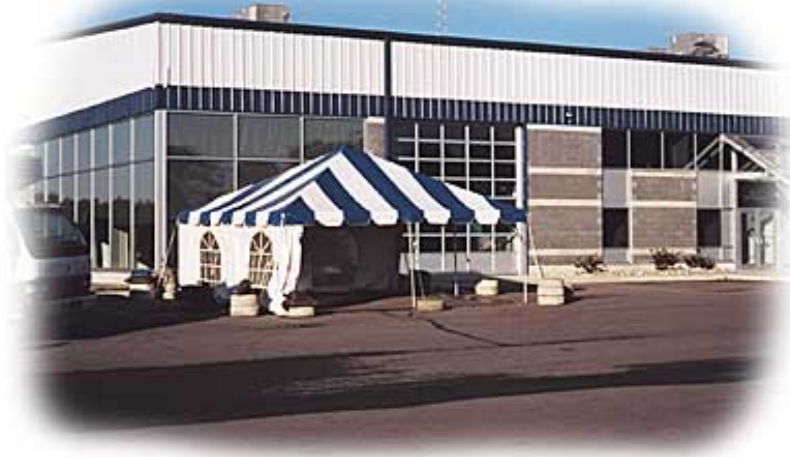
Blue & White frame tent 20 x 40' With Weights No. 102