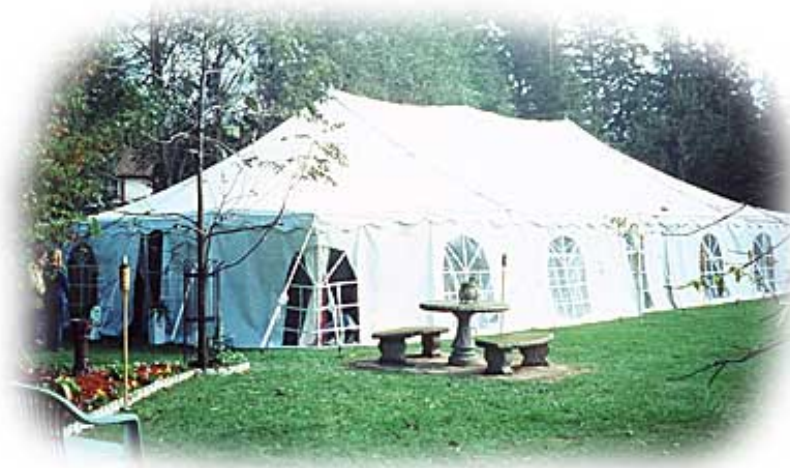
White pole tent with window walls 30' x 60' No. 101