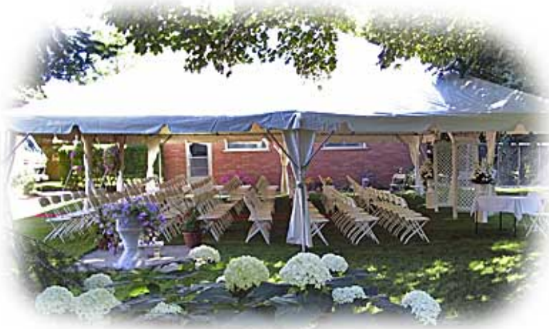
White Frame Tent for ceremony 30' x 40' No. 201