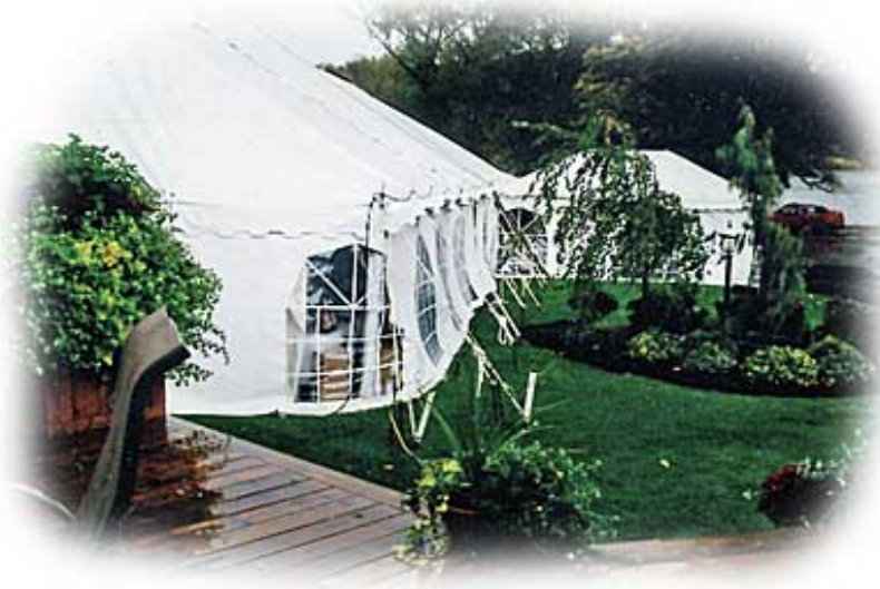
60' x 80' pole tent with 14' x 20' entrance tent No. 220