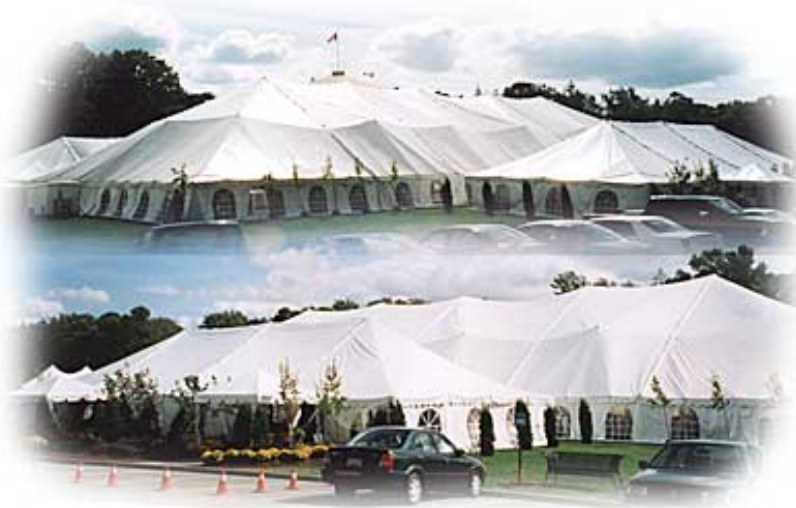
Pole tent 80 x 180' 40 x 80' 40 x 60' 20 x 40' Frame No. 100