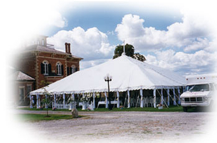
Pole tent Large 60x60 No. 004