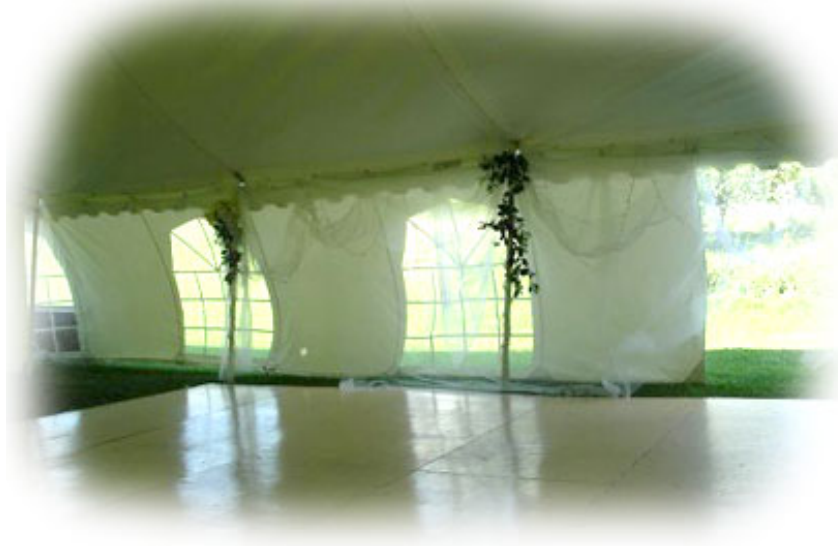
Tent 40' x 80' with 16' x 20' dance floor