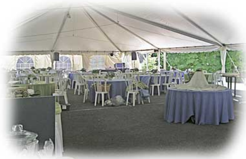
40' x 80' Frame Tent on tennis court surface (interior) No. 210