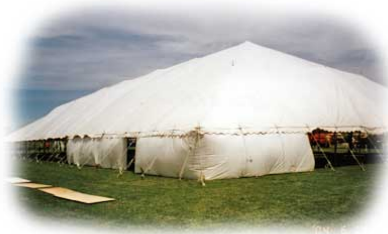
80' x 180' Tent No. 206