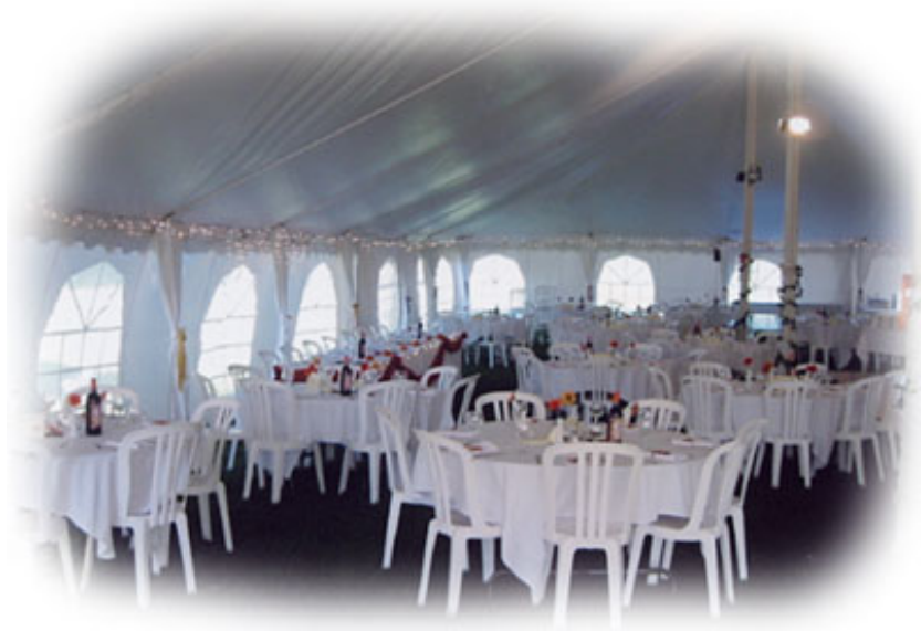
Pole Tent 40' x 80'