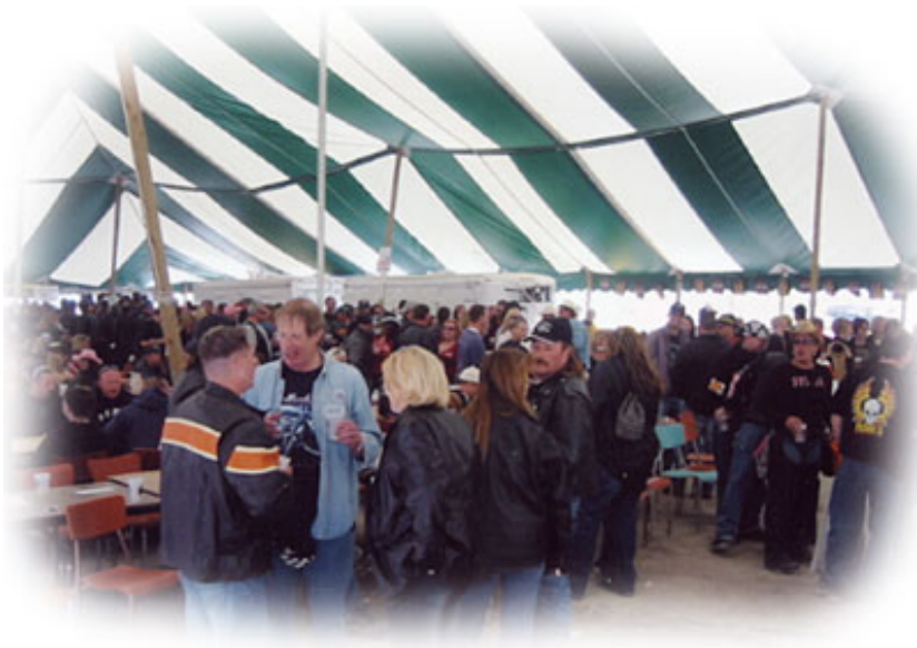
Inside of Green and white 60' x 120'