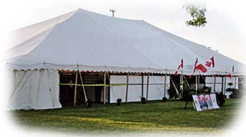
80' x 110' Tent No. 201