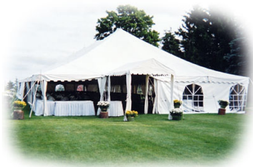
White Pole Tent 40' x 100'