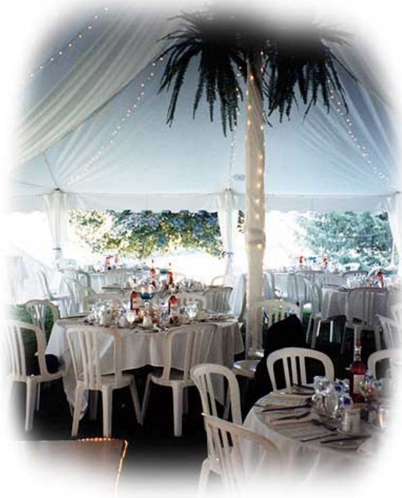
Inside of a 40' tent No. 003