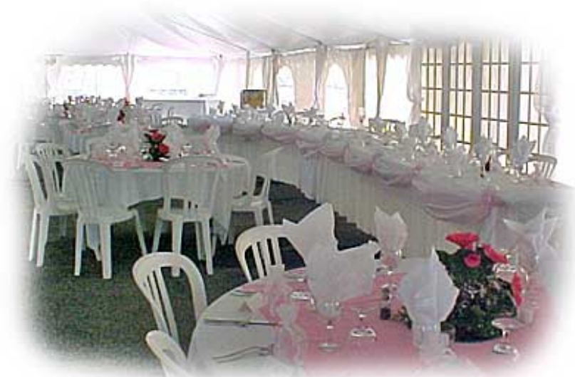
Inside of tent - close up of headtable No. 203