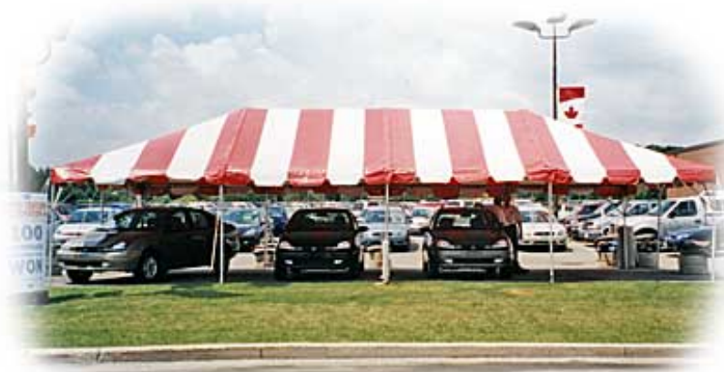
20' x 40' Frame Tent No. 207