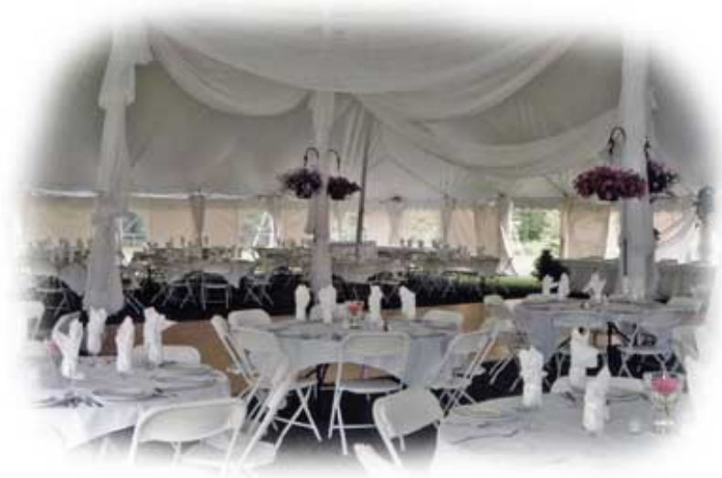
White pole tent 60' x 80'