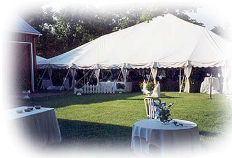
Pole tent 60 x 60' No. 006