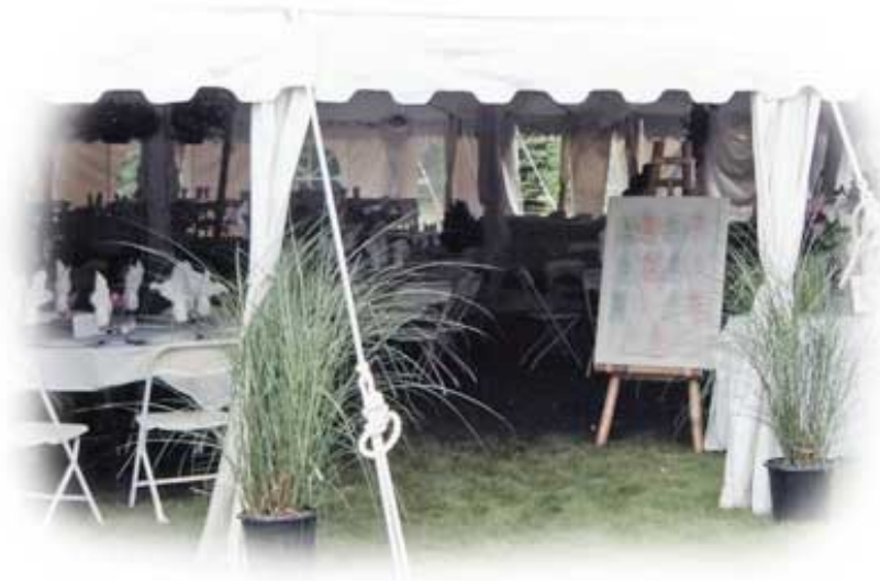
Entrance of a 60' x 80' white tent