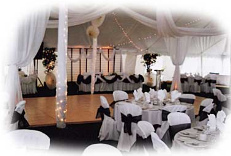
Interior shot of a 60' x 80' pole tent with dance floor No. 219