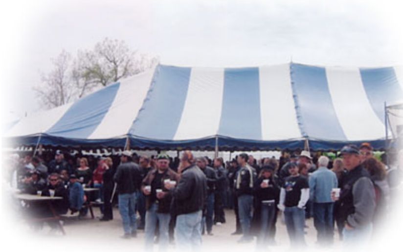
Blue and white 40' x 80' on Beach