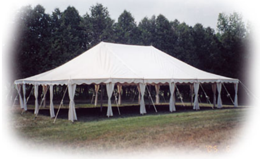
White Pole Tent 30' x 45'