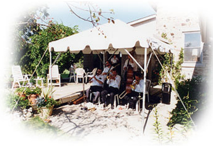
Frame tent Small 10x10' Ideal for band shelter or bar No. 009