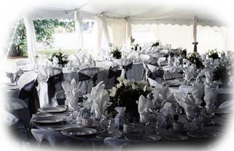
Table settings No. 005