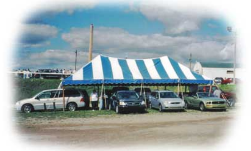
Pole Tent 20' x 40' on 8' sides