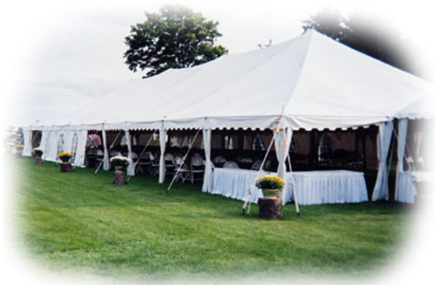
White Pole Tent 40' x 100'