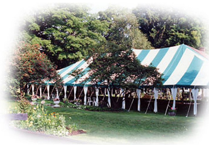
Pole tent Striped Exterior drapes No. 001