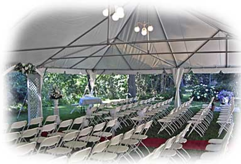
White Frame Tent for ceremony (interior) 30' x 40' No. 206