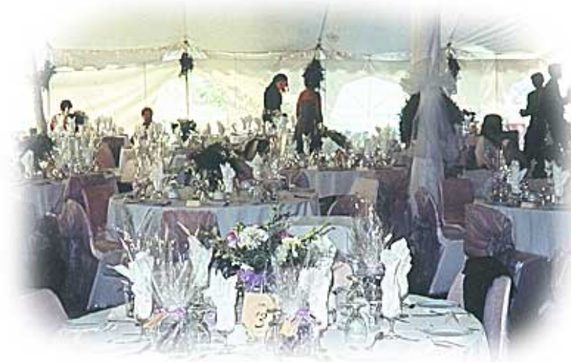
Inside of 60' x 80' white pole tent. No. 106